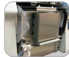
Bag deflator gently forces excess air out of the bag just prior to sealing