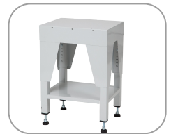
Optional industrial quality mechanically adjustable stand designed for use with our tabletop baggers