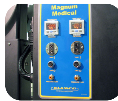
External control system provides ports to validate time, and pressure of seal