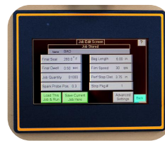
Quickly change bag length at the push of a button or via an input