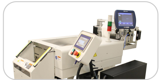
A complete bag and print solution! The Magnum HS with 2D printer option to print text, graphics, and barcodes directly on the bag.

Specifications subject to change without notice