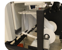
Poly tubing greatly reduces material costs