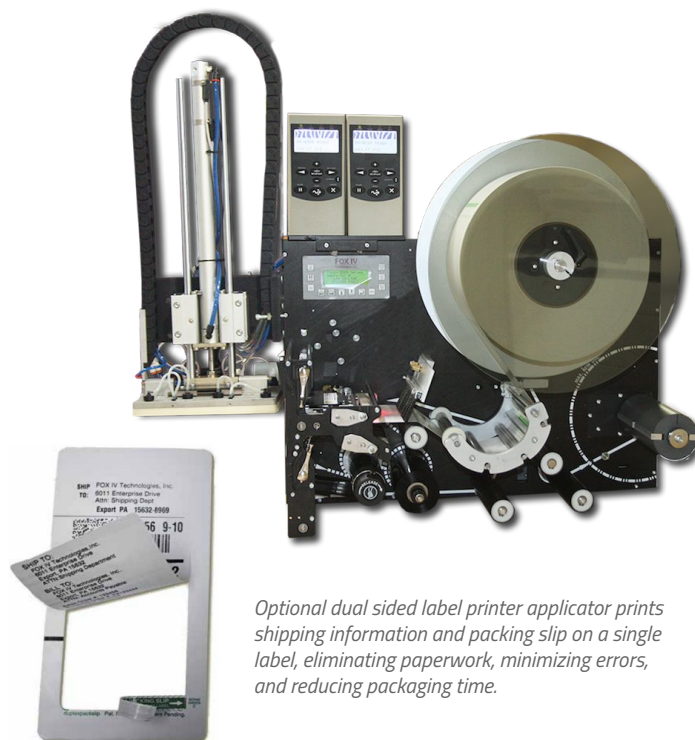
Optional dual sided label printer applicator prints shipping information and packing slip on a single label, eliminating paperwork, minimizing errors, and reducing packaging time.