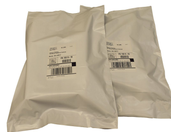
Ideal for bagging soft goods, apparel, and other items shipped in coex poly mailers

Specifications subject to change without notice