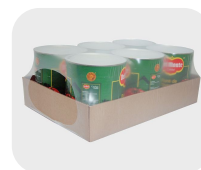
Bundled package with bull's-eye style open ends