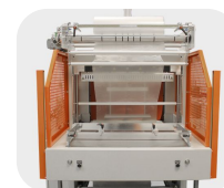
Efficient product loading using adjustable height entry conveyor