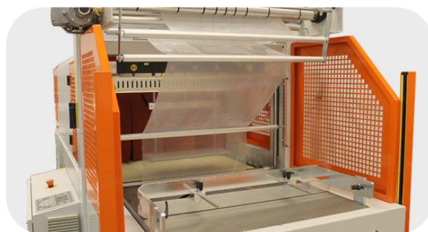
The Clamco 7130MSW Sleeve Wrapper Bundler is a semi-automatic shrink packaging system designed for superior performance, capable of wrapping up to 10 packages a minute.